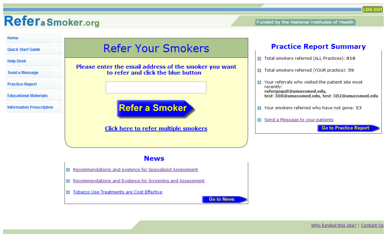
Figure 2: ReferASmoker.org Web-based System Home Page

The core Refer-Your-Smokers function allows providers to proactively refer to and enroll patients in the smoking cessation system during the clinical encounter. To refer a patient, the provider logs into the ReferASmoker.org system and enters a willing patient's email address. Patients can be referred one-at-a-time or multiple patients at one time. Patients can be referred in multiples or one-at-a-time. The patient referral triggers several automated processes: 1) the patient's email is entered into the database of the patient online smoking cessation system enabling the patient to register and login into the patient system; 2) the system links the patient with the appropriate practice and provider, enabling the Practice Reports and Secure Messaging functions; and 3) a series of automated emails to encourage the patient to login to the smoking cessation system.