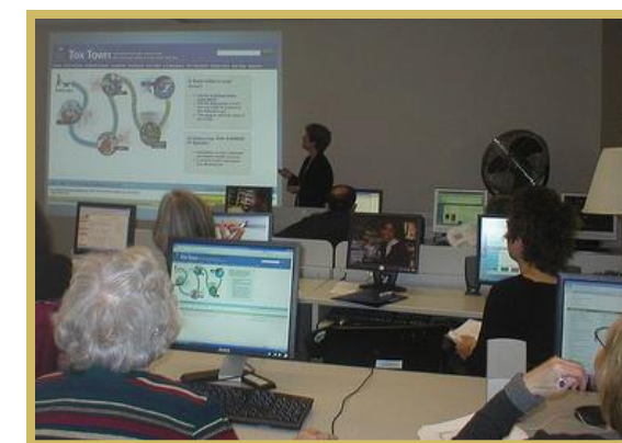
National Library of Medicine training session at the Boston Public Library