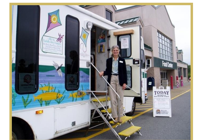
Healthy Community Coalitions Mobile Health Unit

The NN/LM NER funds extended health information outreach subcontracts and express outreach.