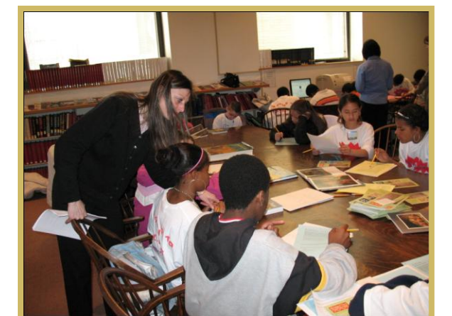
MCPHS Kids to College