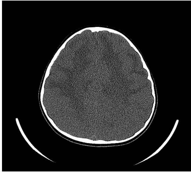
Figure 1: Noncontrast head CT exhibiting bilateral symmetric diffuse deep white matter hypodensities, more marked in the frontal lobes.