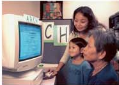
Massachusetts General Hospital Access to Resources for Community Health (ARCH) The Traveler Library collaborates with community organizations to improve access to on-line health information for ethnic and culturally diverse users in low underserved communities. Funding enables Access to Resources for Community Health (ARCH) to improve electronic access to health information to these users.