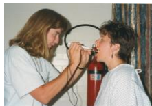
Students in lab workshop 1994

The Graduate School of Nursing Papers documents the establishment of the Graduate School of Nursing and chronicles its early history and development.