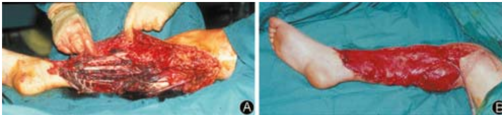
Fig. 3. The final result after a free fasciocutaneous (lateral thigh) flap to the distal leg for a grade IIIB injury.