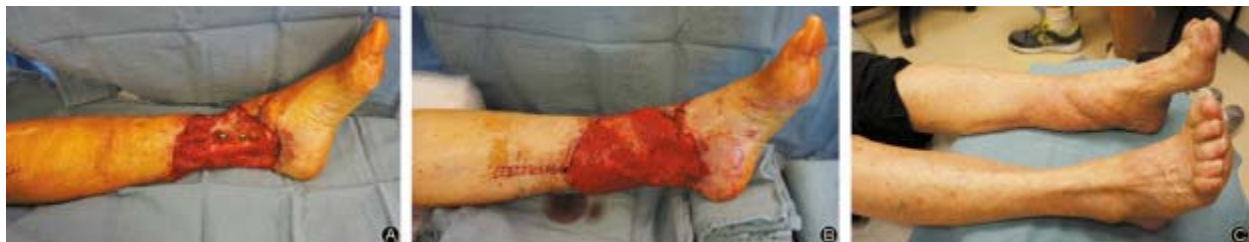
Fig. 1. A grade IIIA tibial fracture. The initial open wound (A) is small but needs extension (B) to display the zone of injury. There is a comminuted segmental fracture with one clearly devitalised fragment requiring debridement. After debridement direct healthy closure with adequate soft tissue was possible allowing classification as IIIA.