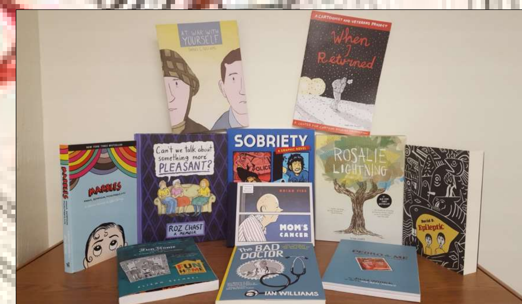
A selection of the Graphic Medicine titles to be included in the book club kits!

Each kit includes 6 copies of a graphic novel, discussion questions, an introduction to reading comics, and evidence-based consumer health information.