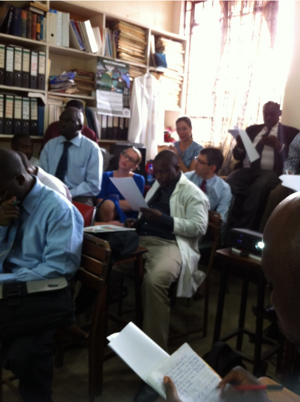
Figure 2. Teleconference in Mbarara, Uganda.