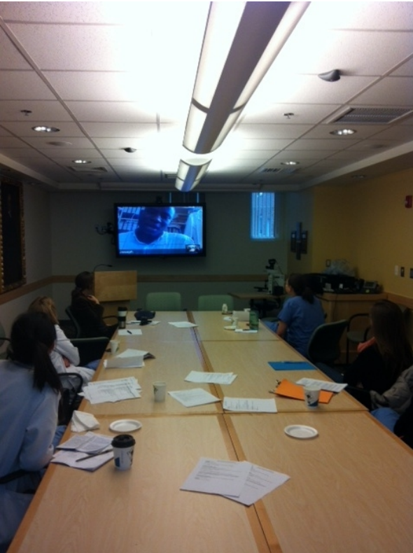
Figure 1. Teleconference setting in Boston.