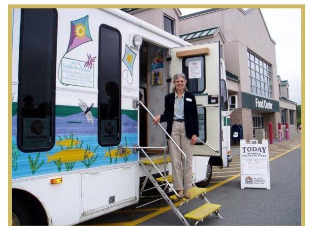
Healthy Community Coalitions Mobile Health Unit

The NN/LM NER funds extended health information outreach subcontracts and express outreach.