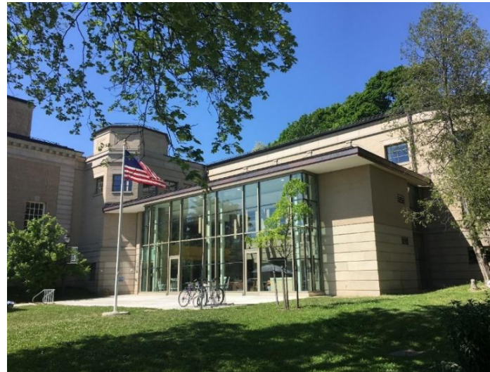
Bangor Public Library, Bangor, Maine, June 2018