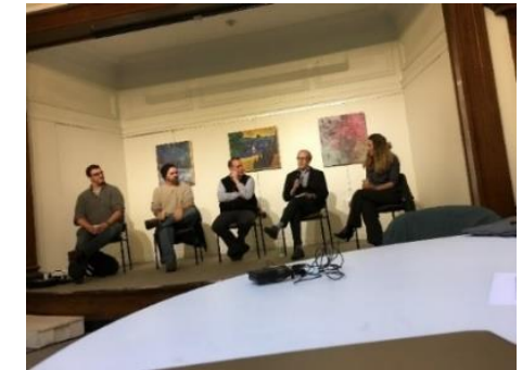
Staff Training, Bangor Public Library Bangor, Maine, Dec 2018