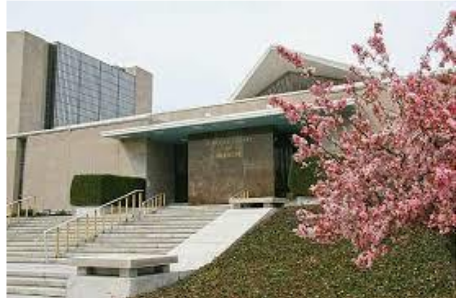
National Library of Medicine