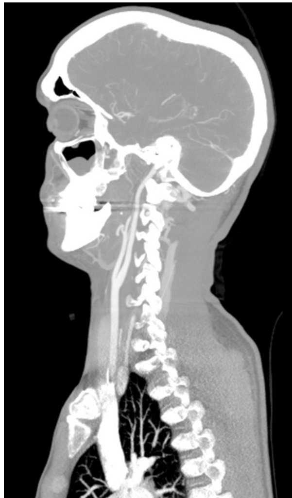
Figure 6: One year follow-up of right carotid artery showing resolving dissection.