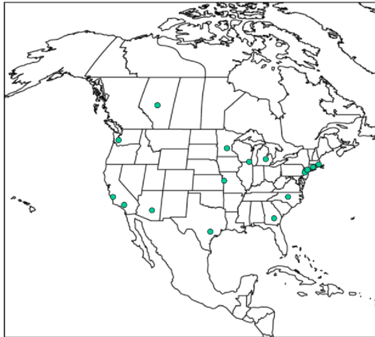
Figure 1 Location of included academic pediatric integrative medicine programs.

vs. 57% of inpatient services. In one case, pediatric referral was required in order to create dialogue with physicians around CAM and to insure that patient load could be accommodated. Physician referral was preferred in the inpatient settings. One service only accepted physician referral because they did not want to be perceived as going behind any physician's back, while another accepted self-referral if the patient's insurance accepted it.