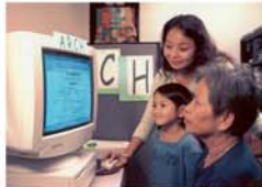
Massachusetts General Hospital Access to Resources for Community Health (ARCH)

A = Outreach Activities by Subcontractor B = Outreach Participants by Subcontractor C = Outreach Activities by RML Staff