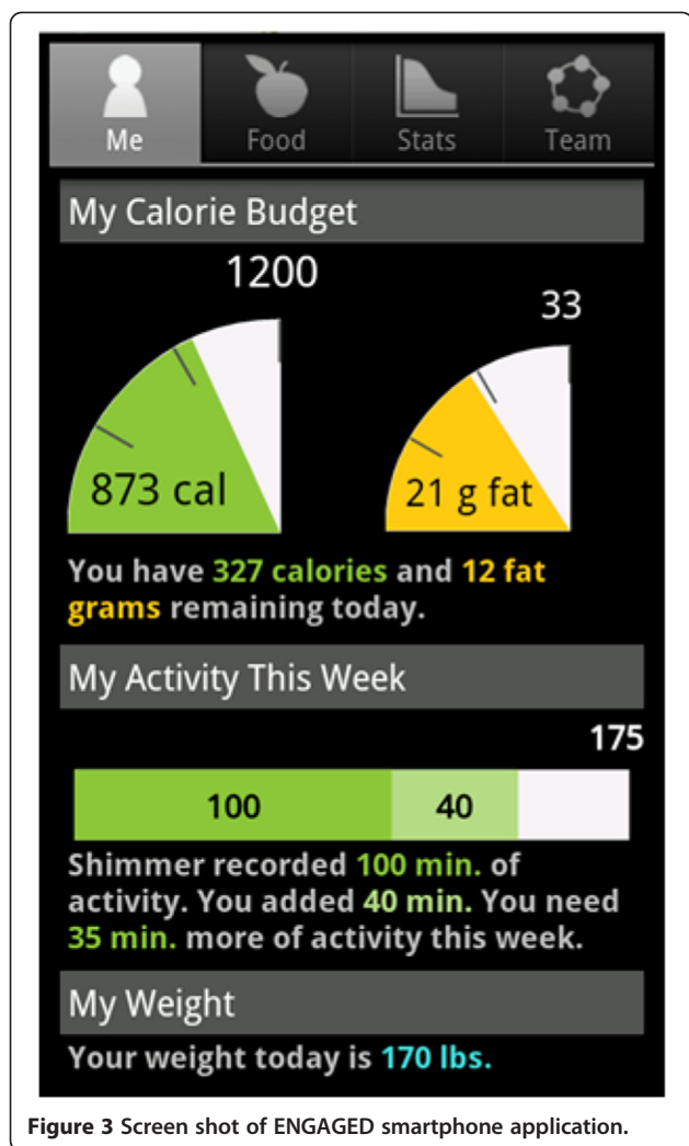
Figure 3 Screen shot of ENGAGED smartphone application.

3- and 6-months during each cohort. The team with the greatest weight loss percentage at each time point will win $400, to be divided evenly among the group members ($50 per team member).