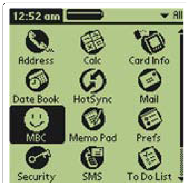
Figure 1 Screen shot of the MBC program on a PDA. Participants select the MBC icon to open the program.

The research design is a four by three factorial involving one between subjects factor (condition) with four levels and one within subjects factor (time) with three levels (baseline, prescription, follow-up). Inactive adults with suboptimal diet (N = 200) will be randomly assigned to one of four treatment conditions: a) ↑FV↑PA increase fruit and vegetable consumption to >5/day and increase moderate-vigorous physical activity to >60 minutes/day); b) ↓Fat ↓Sed: decrease saturated fat consumption to < 8% per day and decrease targeted sedentary leisure