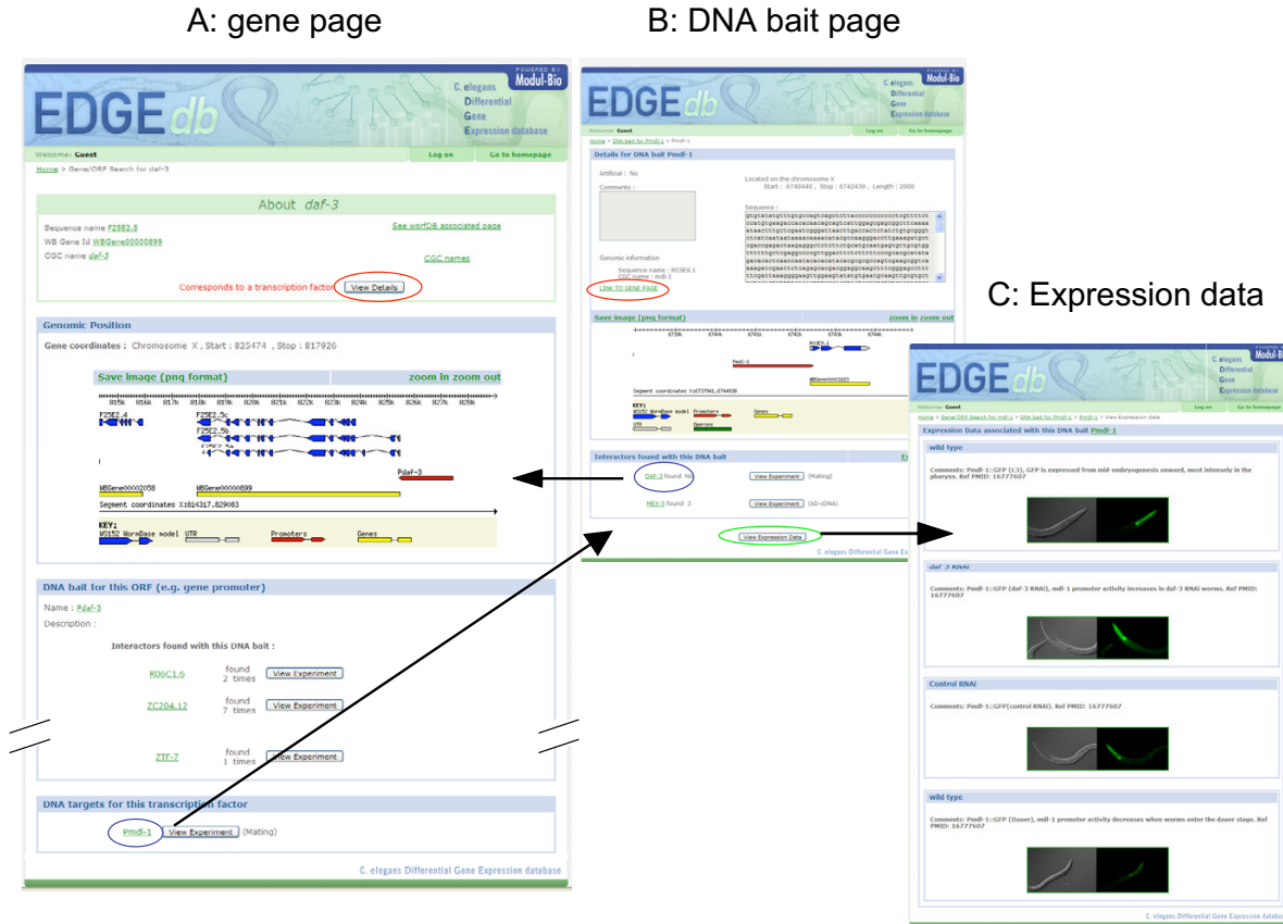
Figure 2 EDGEdb gene, DNA bait and expression pages. (A) EDGEdb daf-3 gene page. The top section contains the different daf-3 gene identifiers, each of which is linked to WormBase. In addition, it contains a link to Wormdb, and the detailed TF page (red circle). The middle section contains the genome view of the daf-3 gene. The third section lists the DNA baits associated with daf-3 (i.e. the daf-3 promoter, Pdaf-3 ) and their corresponding yeast one-hybrid interactors (i.e. TFs that bind to Pdaf-3 ). The bottom section includes the DNA baits bound by the TF Daf-3 (blue circle). By clicking this one goes to the Pmdl-1 DNA bait page. (B) EDGEdb DNA bait page for Pmdl-1 . This page displays the DNA bait sequence and genomic coordinates; IDs of the gene corresponding to the DNA bait and link to the gene page (red circle). The middle section contains the genome browser. In the bottom section, the list of the interactors found with the DNA bait and links to the relevant experiments and gene pages are shown (blue circle). By clicking this link one goes back to the daf-3 gene page. A link to the page containing the expression patterns driven by the DNA bait is included (green circle). By clicking this one goes to the expression page for Pmdl-1 . (C) Expression data page for Pmdl-1 . From top to bottom: GFP expression driven by Pmdl-1 in wild type animals, in daf-3(RNAi) animals, in control RNAi animals, and in dauer animals. See Deplancke et al. [5] for details.

suming. EDGEdb allows the efficient retrieval and integration of different protein-DNA interaction and TF-TF dimerization datasets, either through the export tools (i.e. protein-DNA interactions) or through the TF page (i.e. TF-TF dimerization). Moreover, EDGEdb enables the export of interaction information for multiple genes or TFs at a time. Second, specific sequences bound by a TF or a set of