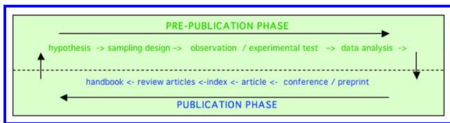
Figure 1. Data and Publication Life Cycles. (Reproduced with permission from Anna Gold, ©2007, CNRI)(6).

In 2006, recognizing that libraries would need to adapt to changing conditions brought about by networked science, the Association of Research Libraries (ARL) appointed a task force to raise awareness and position research libraries to participate in e-Science. One of the task force's key findings is that librarians need to be actively engaged with their user communities more than ever before, and to do this, librarians need "to not only understand the concepts of a domain, they also need to understand the methodologies of scholarly exchange" (9).