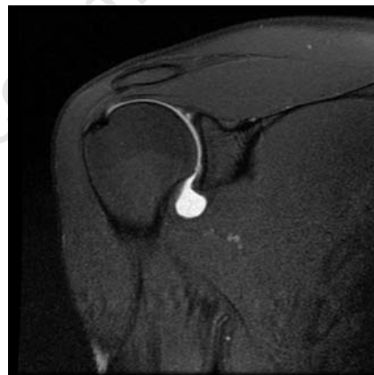
Figure 1. Coronal MRI image of the shoulder showing extravasation of the contrast media into the type II SLAP tear.