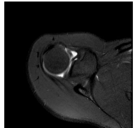
Figure 2. Axial MRI demonstrating tear of the superior labrum from the anterior to the posterior direction consistent with a type II tear.

ligament, joint capsule, articular cartilage, and tendons. 9 The sensitivity and specificity of MRI for the diagnosis of SLAP lesions have been reported as 98% and 89.5%, respectively. 14 While the sensitivity and specificity of MRA for the diagnosis of SLAP lesions are reported to be 89% and 91%, respectively. 15