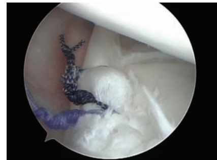
Figure 4. Repair of the type II SLAP tear with suture anchors.

There have been several portals described