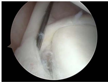
Figure 3. Arthroscopic picture showing the type II superior labrum tear from an anterior (3 o'clock) to posterior (9 o'clock) direction. An 18 gauge needle is used to elevate the tear.

Attempts have been made to correlate physical exam maneuvers to the proposed causative mechanisms of SLAP lesions in order to selectively identify SLAP lesions by reproducing pain with the maneuvers. Recently, Kibler et al. evaluated the accuracy of current clinical tests for the diagnosis of biceps tendon injuries and SLAP lesions. 18 In a prospective analysis of patients presenting with shoulder pain, they compared clinical exam maneuvers with intraoperative findings and evaluated the sensitivity, specificity, accuracy, positive predictive value (PPV), and negative predictive value (NPV) for each maneuver/test. Statistical analysis was also performed to determine the