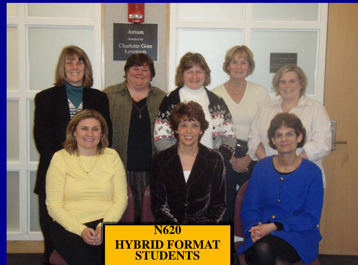
N620 HYBRID FORMAT STUDENTS

Exploratory prospective design. Qualitative data gathered from student focus groups and interviews. Quantitative data gathered through initial, formative and end of course surveys, student assignments, grades.